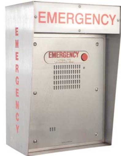
Shown with ETP-400