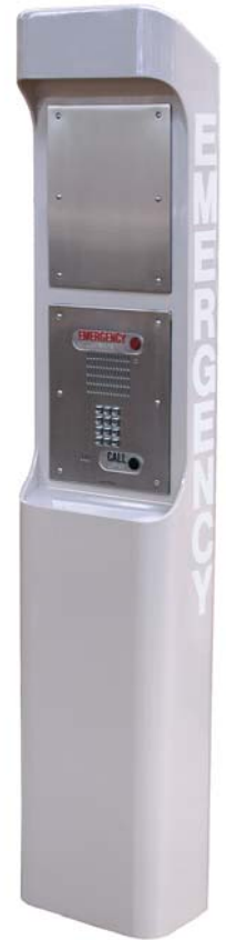
Shown with ETP-400K and blank faceplate

Mounting: Mounts into concrete foundation using included hardware (shipped in advance)