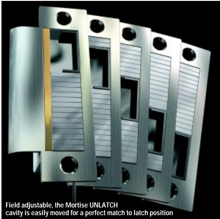
Field adjustable, the Mortise UNLATCH cavity is easily moved for a perfect match to latch position

The chief problem with procuring electric strikes to work with North American Mortise Locks is that there is no standard or commonality among the lock manufacturers as to the vertical position of the latch and dead latch pin in the standard ANSI 4 7/8 door preparation. This means that the electric strike must be specified and purchased individually to suit the particular Lock model on the door. Until the introduction of the Mortise UnLatch! The UnLatch is set by the installer in the field, just prior to installation, to correspond to the Lock model. As the graphic below shows, the latch cavity can be moved anywhere on the UnLatch face with the finger plate occupying the space above and below the latch cavity. The instructions show the correct setting for all North American Mortise Lock models and adjustment is done quickly with a screw driver and allen wrench . Product selection, inventory and service issues are all drastically simplified with the Mortise UnLatch.