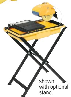
shown with optional stand