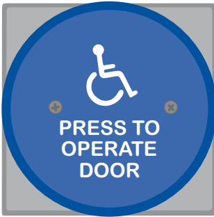
#79-H (Blue Powder Coat with Engraved Legend)