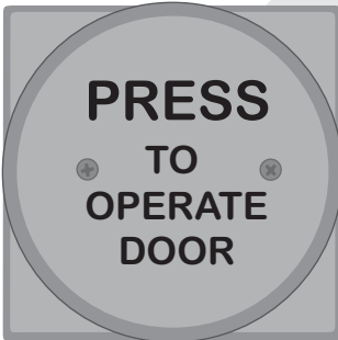
#79-P (Stainless Steel with Black Paint Filled Legend)