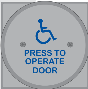
#79-HSS (Stainless Steel with Blue Paint Filled Legend)