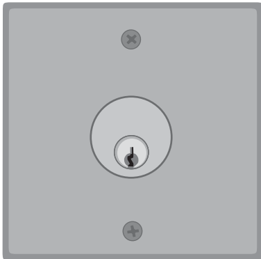
#730 (4 1/2" x 4 1/2" Face Plate)