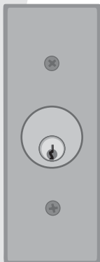
#730-N (1 11/16" x 4 1/2" Face Plate)