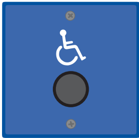
#614-H (Blue Powder Coat with Engraved Legend)