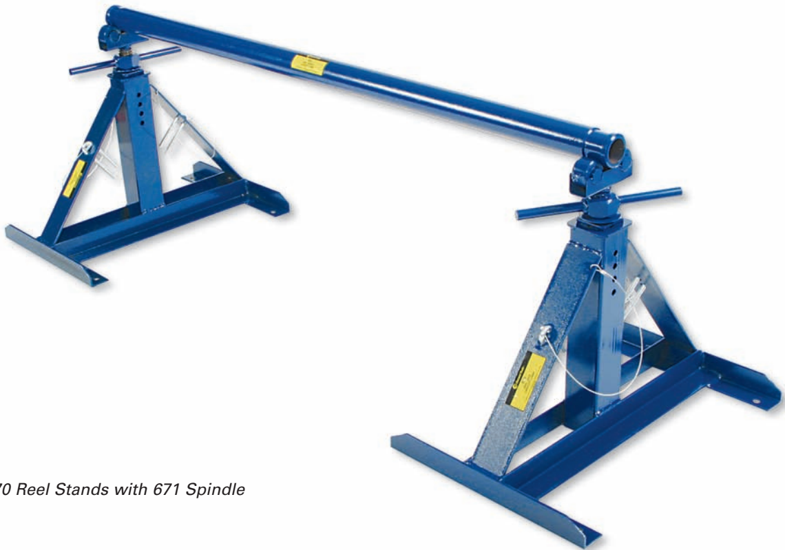
670 Reel Stands with 671 Spindle